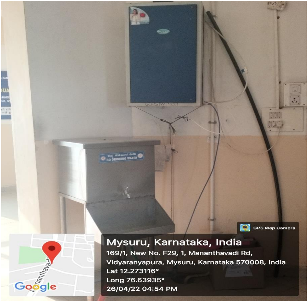
Water RO Filter

A RO filter is provided for drinking water in all the floors and regular maintenance is done by the authorised person.