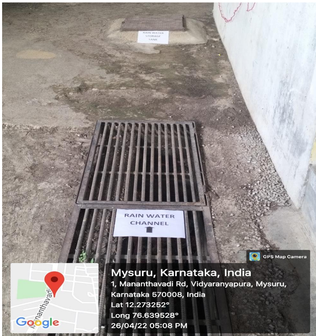
Rain Water Channel