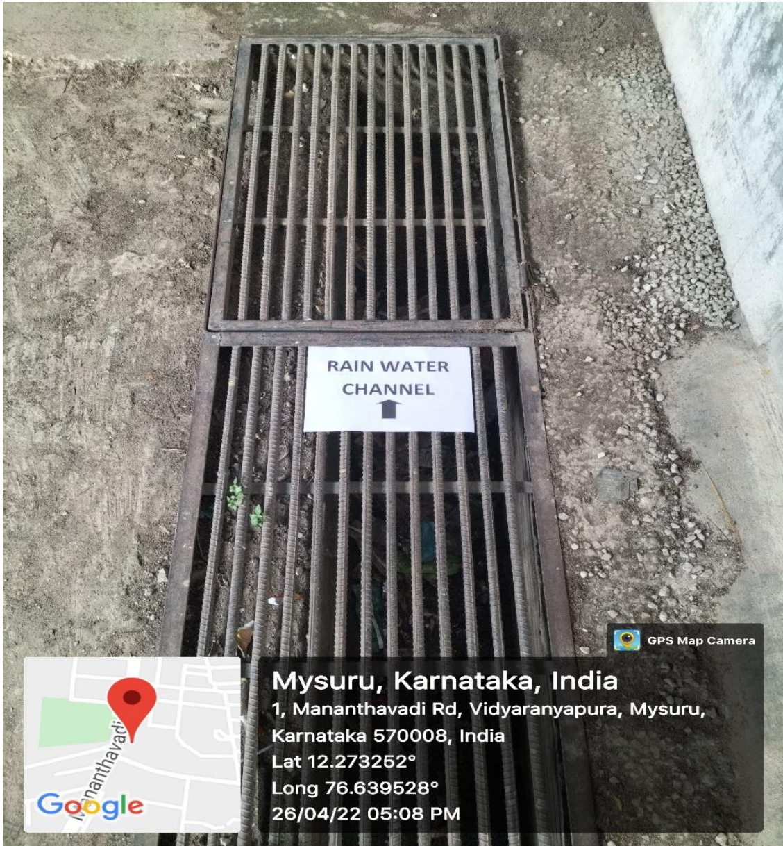
Rainwater and Waste Water Channel