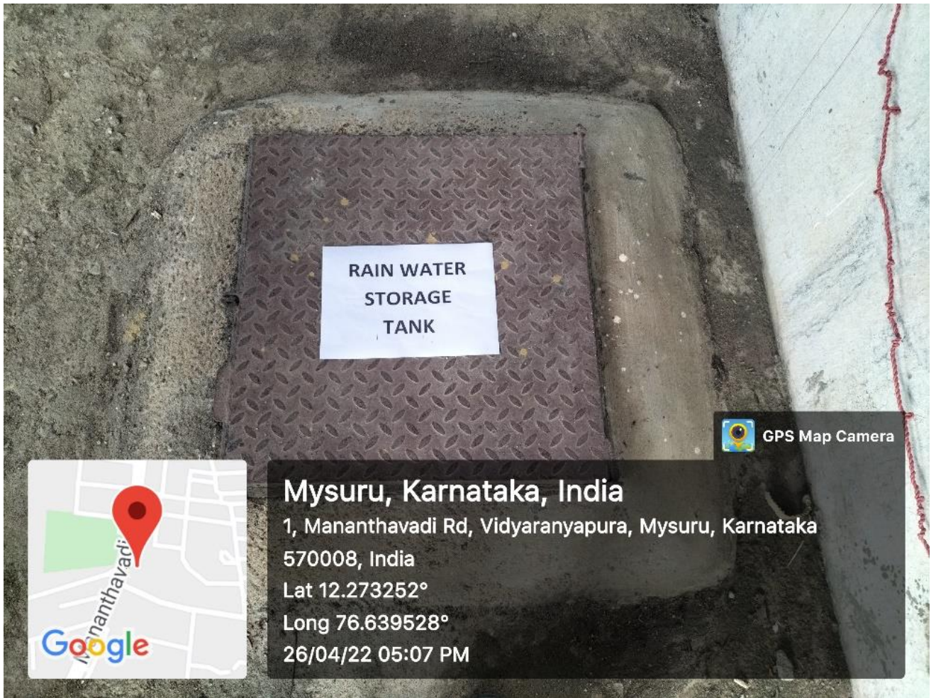
Rainwater & Waste Water collection Tank

Waste water is collected in tanks and used for watering the plants in and around campus which helps in water conservation and make the campus green.