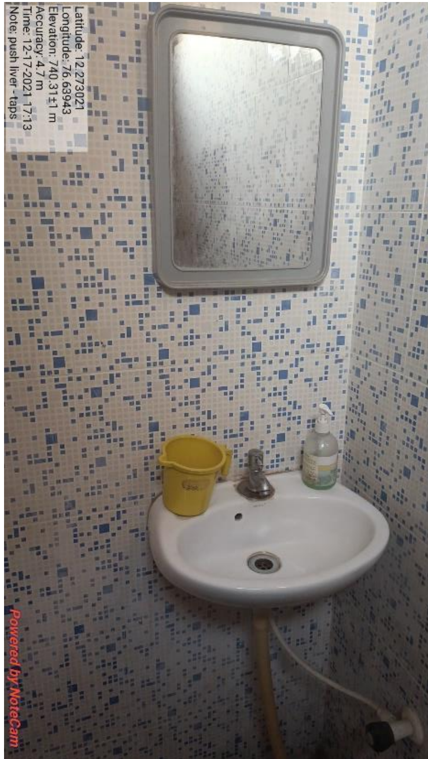
Wash Basin with Liver Taps

Our institute's main corporation water line is distributed across the campus through well laid pipes for drinking, garden and rest rooms.