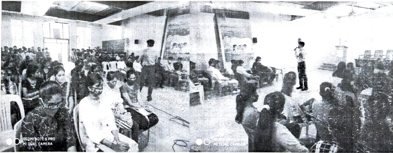
Fig: First year students taking part in the Orientation Program

Summary: The college takes initiation to conduct Orientation sessions to the freshers' every year before the commencement of the academic classes to the students, the orientation is organized with the intention to familiarize the students to the college life. Therefore, academics as well as extracurricular activities will be briefed out to the students. During orientation, students will be made aware of opportunities needed to socially integrate into the college culture. Students also can learn about the various student organizations in which they can be involved. The social aspects play a significant role in one's collegiate experience and enriches the academic life of students.