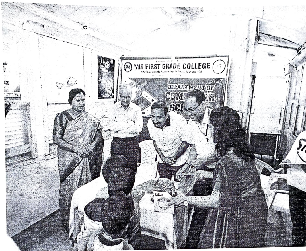
Fig 1: Chief Guest and Guests of Honor distributing the Uniforms and Stationary