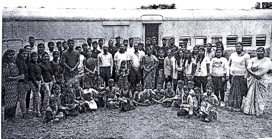
Fig 2: Students of IV sem BCA along with beneficiaries and dignitaries

Kanagaraj PRINCIPAL M.T. FIRST GRADE COLLEGE # F-29/1, 3rd Stage, Industrial Suburb, Fort Mohalla, Mysuru-576 909