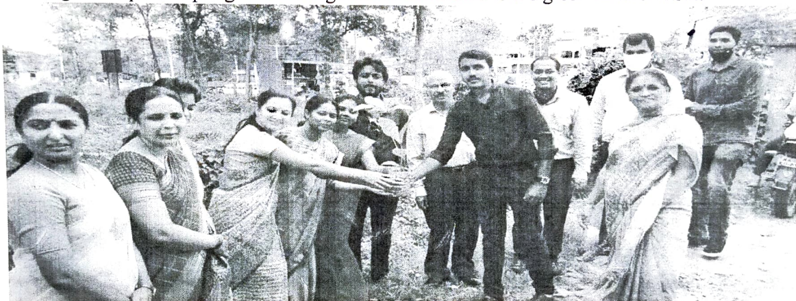
Fig: Faculty members planting the saplings

Summary: Environmental day was celebrated on 06/06/2020 at MITFGC, Mysuru, the faculty members and students enthusiastically took part in planting saplings. All the faculties were gifted a plant sapling to encourage and to contribute to the green Environment.