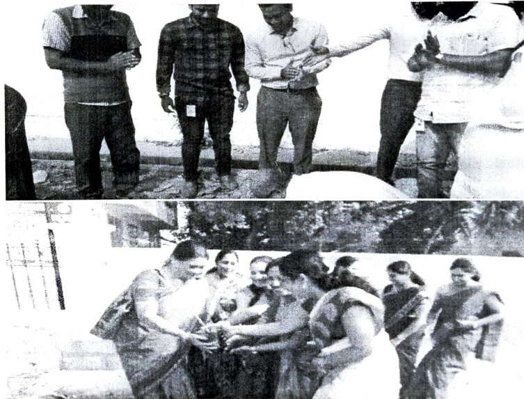
Fig: Faculty members indulged in planting saplings

Summary: The faculty members of MITFGC, Mysore celebrated new Year 1/01/2018 by planting saplings to celebrated enthusiastically. They planted saplings to create a green corner. The event was conducted successfully with whole hearted participation and awareness about plants.