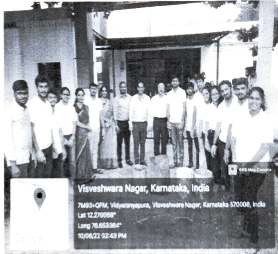
Encl: Photos of the Event