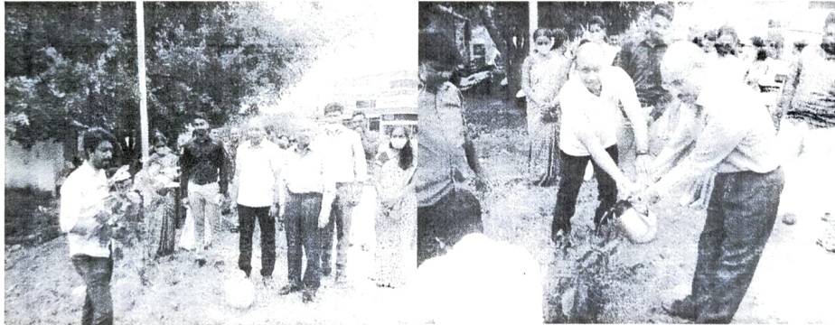
Fig: Planting samplings in front the college