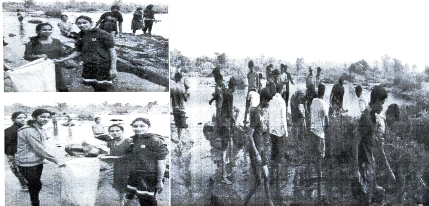
Fig: Volunteers of NSS, MIT FGC, Mysuru Cleaning Kaveri river channels