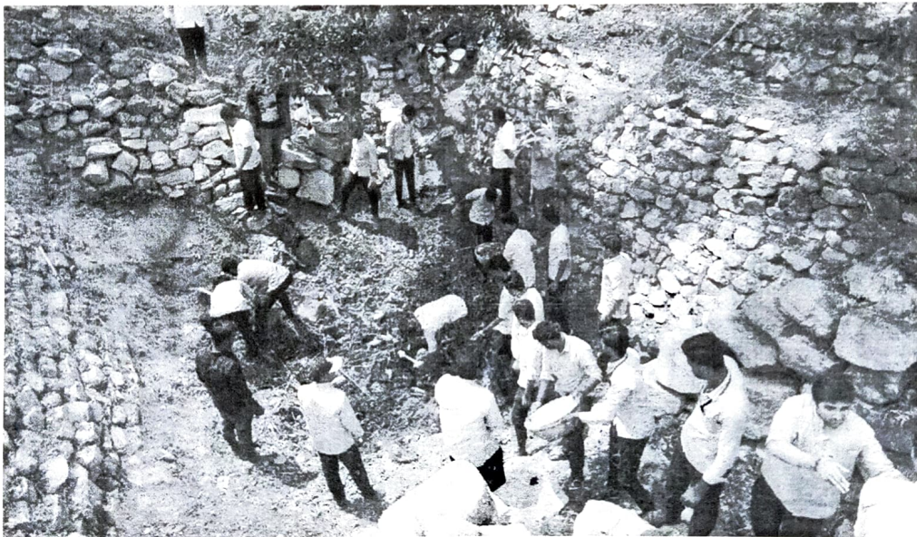
Fig: NSS Volunteers cleaning the pond