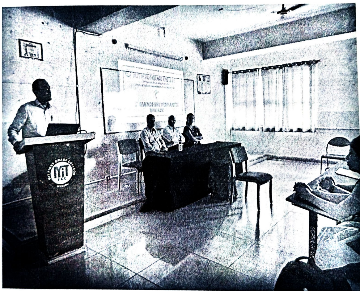
Fig 2: Geo Tagged Photo of the session on “Experience of Entrepreneur”