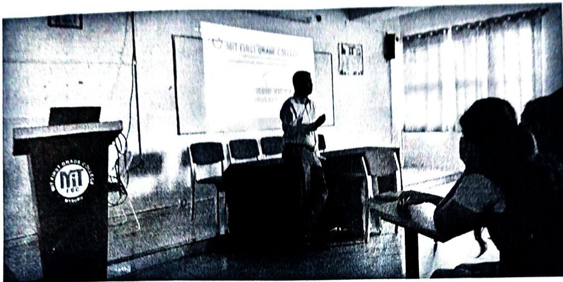
Fig 1: Geo Tagged Photo of the session on “Experience of Entrepreneur”