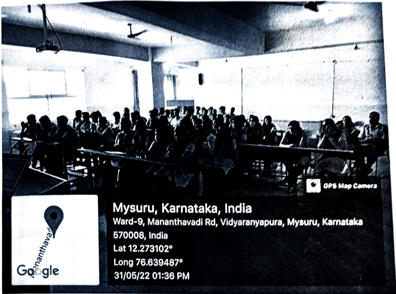
Fig 3: Geo Tagged Photo of the session on “Experience of Entrepreneur”