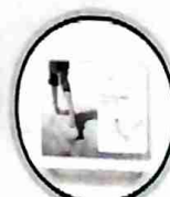
Google Nest Hub