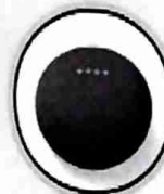
Google Nest Mini