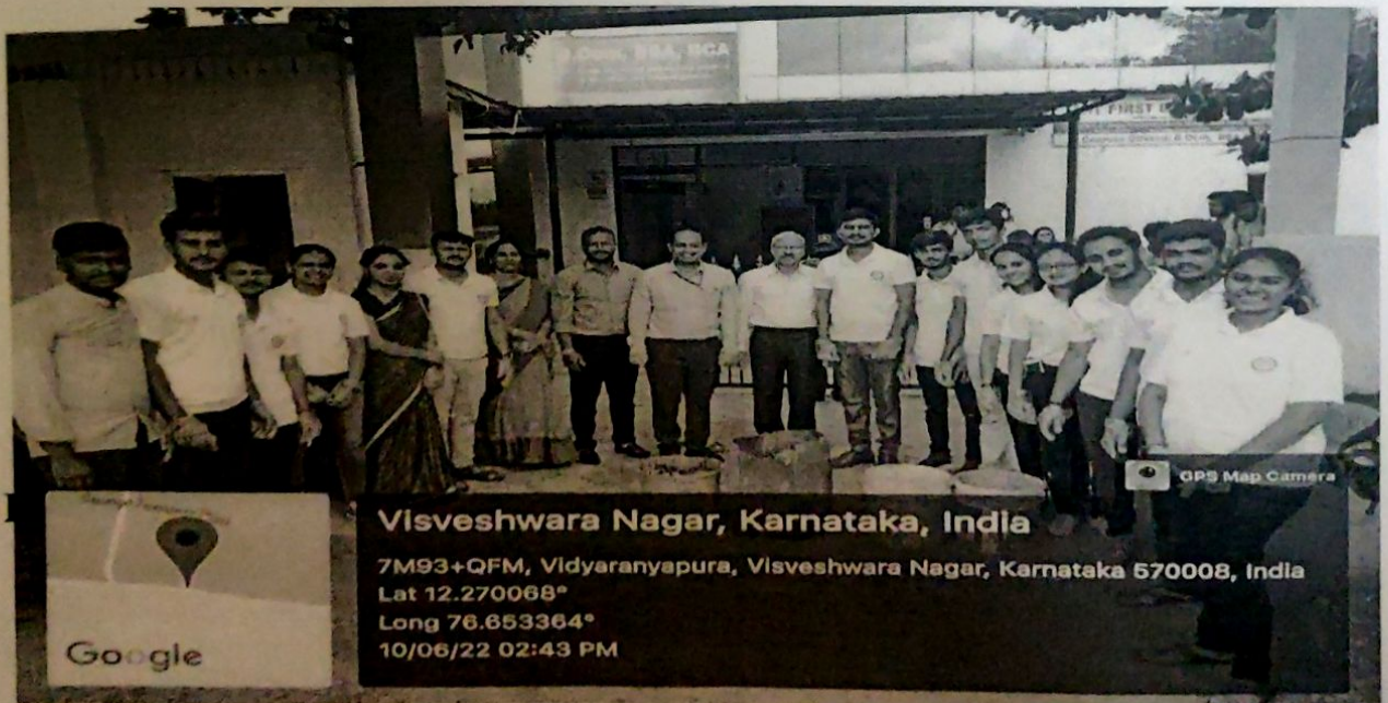
Photo 1: Photo of the Event on "Overview of Swachh Bharath and Importance of Cleanliness."