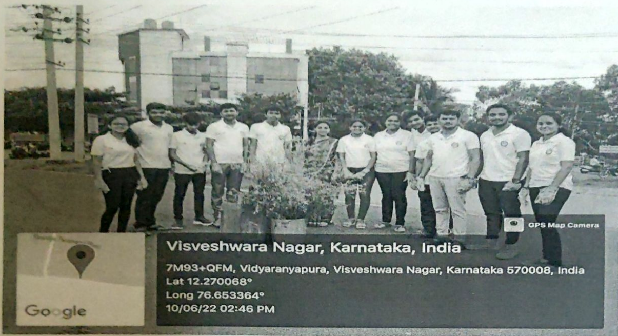
Photo 3: Photo of the Event on “Overview of Swachh Bharath Event and Importance of Cleanliness.